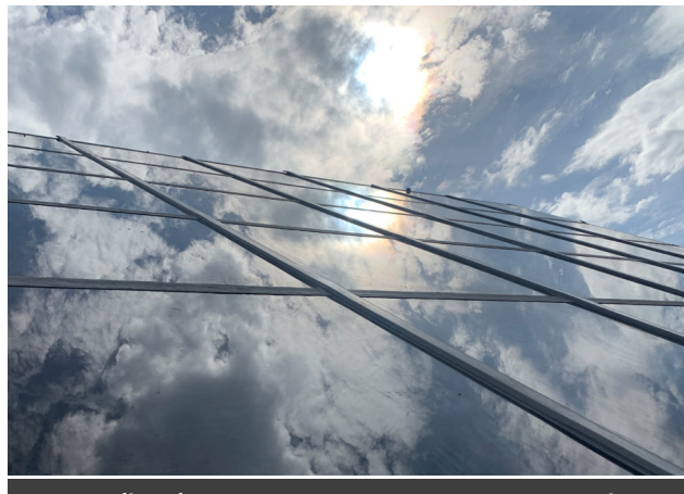
1250 lineal metres, or custom Spectrem Rstoration Overlay supplied as 286 pre-cut lengths to ease